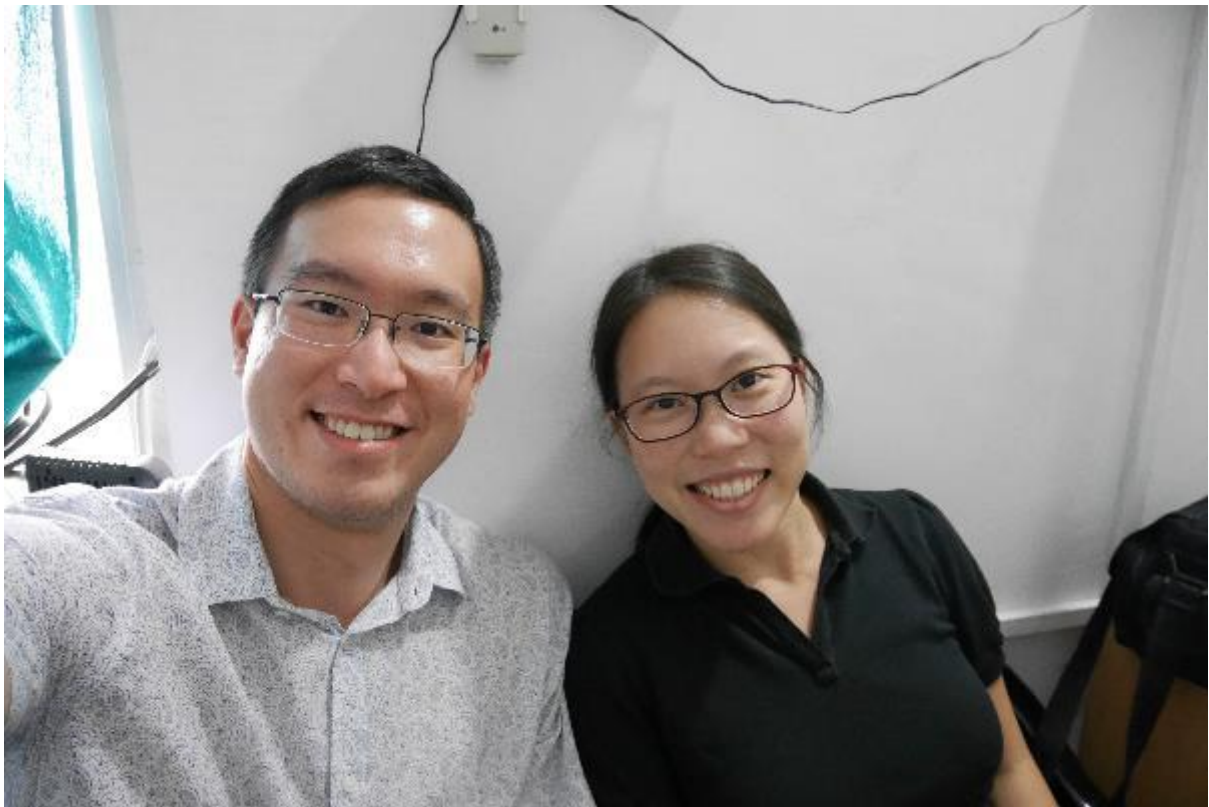
End of day!