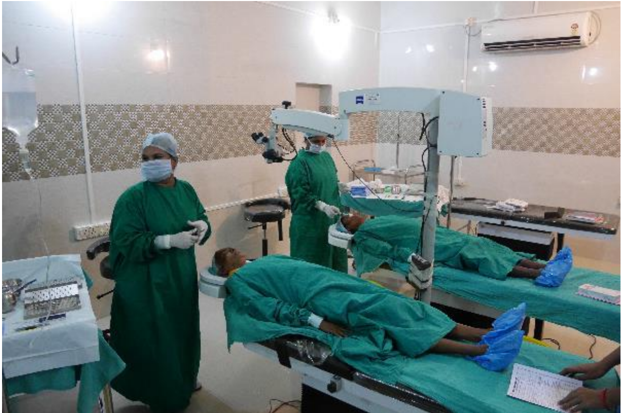
An early start in the OT with the 2 uber efficient scrub nurses already prepping the first 2 patients for surgery